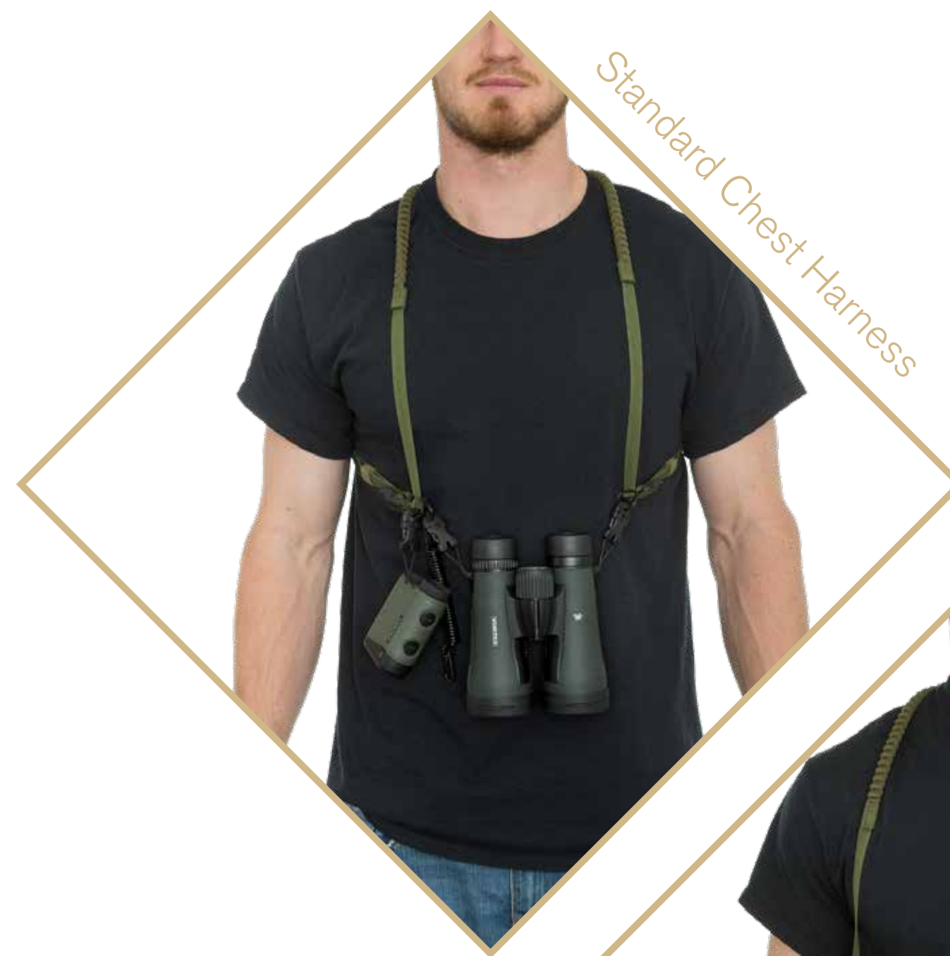
Standard Chest Harness