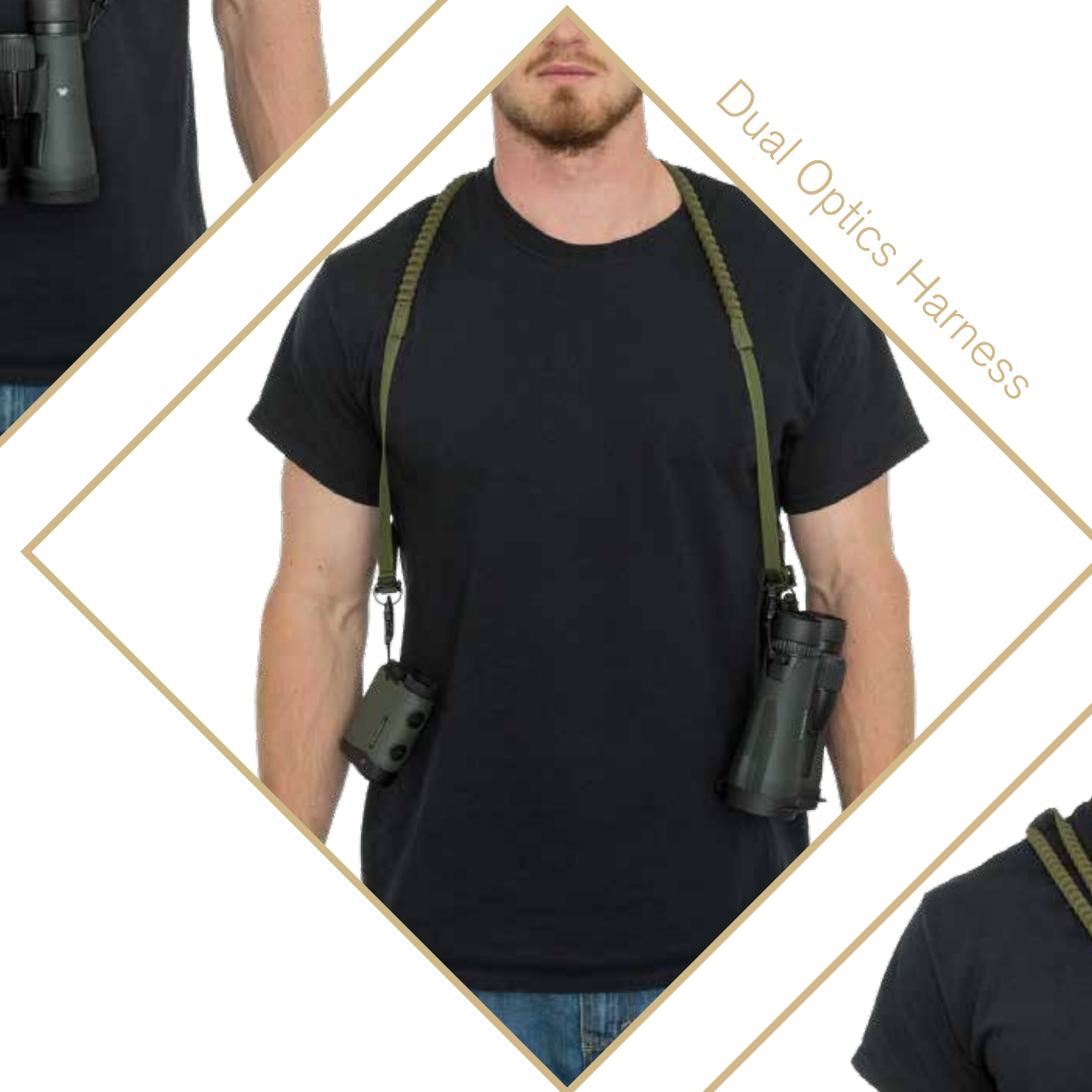
Dual Optics Harness