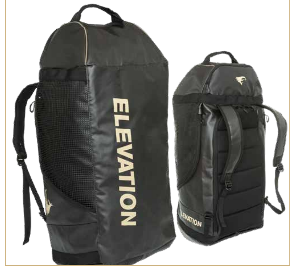
CHARTER TRAVEL DUFFEL