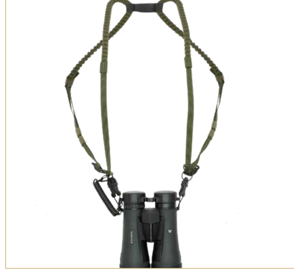
DUAL BINO HARNESS