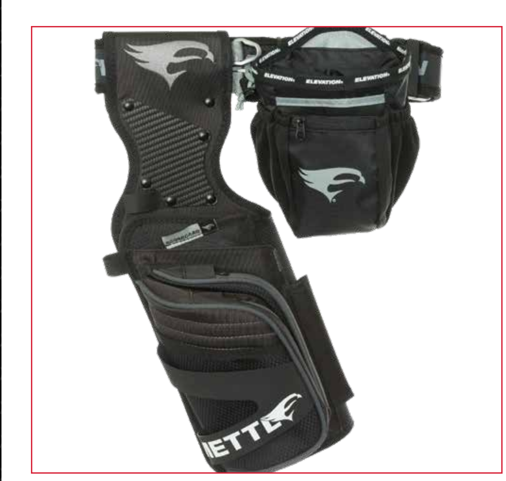
METTLE FIELD QUIVER PACKAGE

Black & Silver RH #1601108 Black & Silver LH #1601109