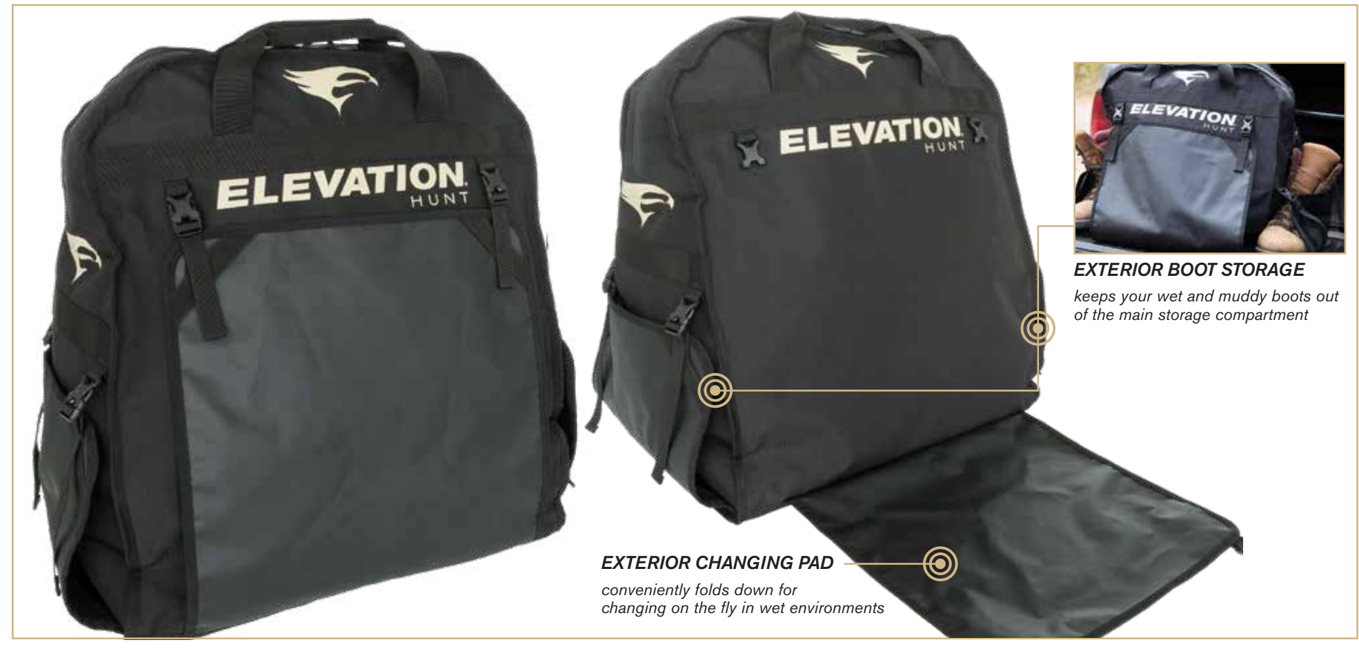
TOTALITY SCENT BAG