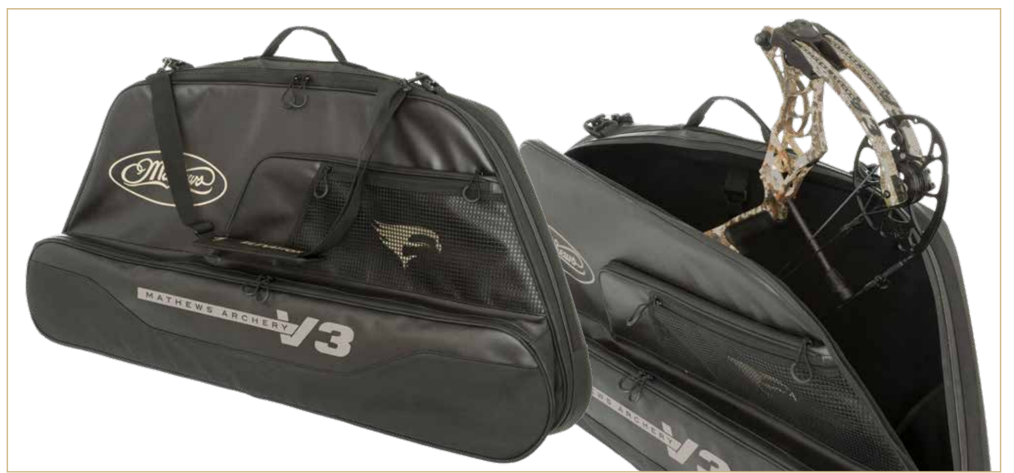
MATHEWS V3 BOW CASE